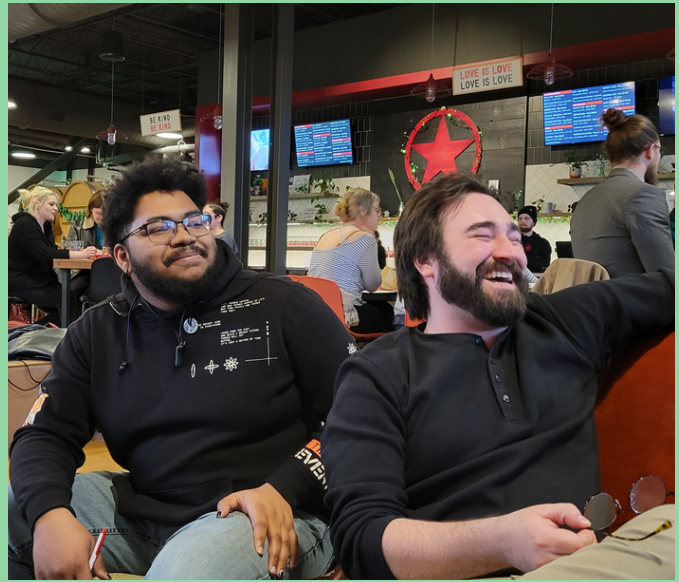
FIERCE COMPETITION UNDERWAY!