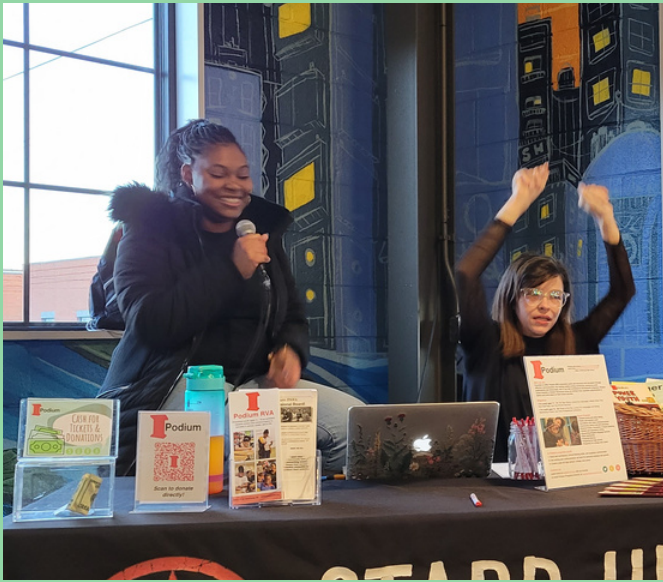
OUR WONDERFUL MC AND JUDGES OF THE EVENING.

On March 14, 2023, Podium's Young Professional Board hosted a trivia giveback night at Starr Hill Brewery! It was an awesome evening filled with friendly people, good times, drinks, and fierce competition! Thank you to everybody who came out that evening, and thank you to Starr Hill Brewery for being such incredible hosts. Congratulations to our 1st and 2nd place winners of the evening as well! 2nd place winners received an awesome Podium swag bag with t-shirts, journals and more. Our 1st place prize was another swag bag generously donated by Richmond Kickers! Missed trivia? Stay tuned to Podium's socials to hear more about our giveback events.