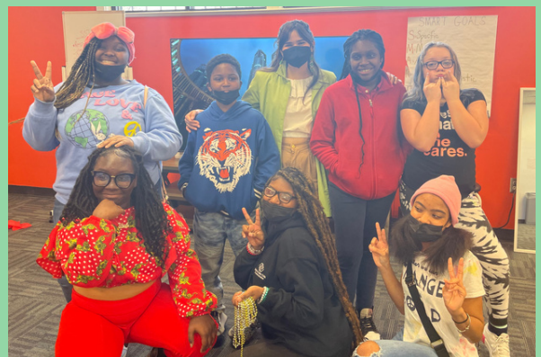
YOUTH WITH THEIR PODIUM MENTOR AT THE BOYS AND GIRLS CLUB