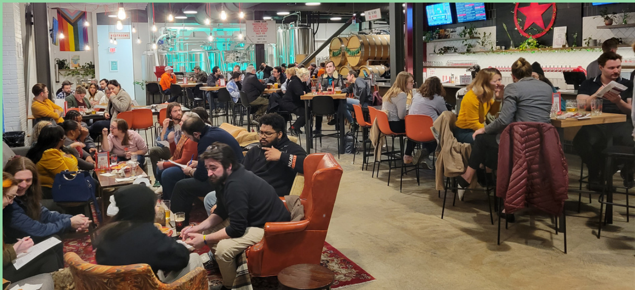
THANK YOU TO EVERYONE WHO SHOWED UP TO SUPPORT PODIUM!

Podium's Young Professional Board is a group of dedicated young people who meet monthly, plan Podium events, and prepare members for working on a formal Board of Directors. If this interests you, you can learn more at www.podiumrva.org/young-professionals-board !