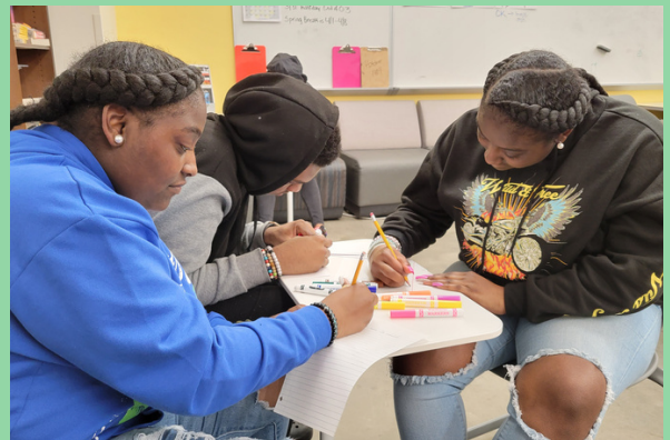
FAMILIES WRITING DURING PARENT ENGAGEMENT NIGHT AT HIGHLAND SPRINGS HS

Flowers are blooming and so are our spring programs. We are so excited to wrap up the school year hosting 5 high school and 3 middle school programs! On March 31st, we closed our second college scholarship application season. Now, we begin the very difficult selection process of selecting our 2023 Anne F. Waldruff Excellence in Education scholarship recipients. Join us on Mon, June 5th as we honor 3 returning scholarship winners with their second year awards and announce 5 new Podium scholars: RSVP Today !