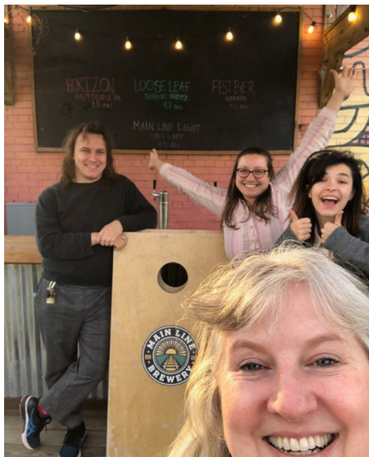
THE PODIUM RVA EVENTS COMMITTEE HARD AT WORK AT MAIN LINE BREWERY